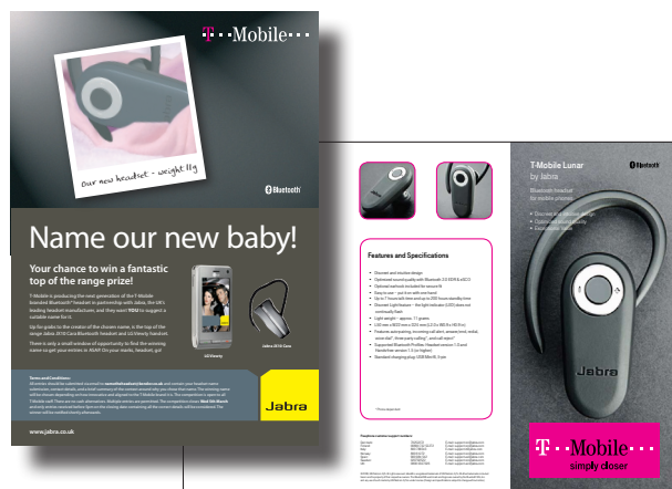
Product Launch Communications Packaging content and retail staff incentive, established as top seller shortly after launch