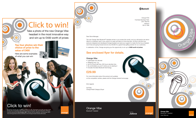
Retail Product Launch Incentive 4 week period to maximise product and brand awareness, employees from over 50 participating stores entered