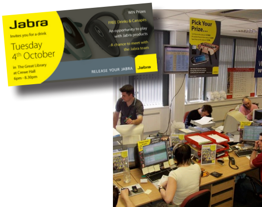
Dealer Team Sales Incentive 6 week incentive period, 11% sales uplift