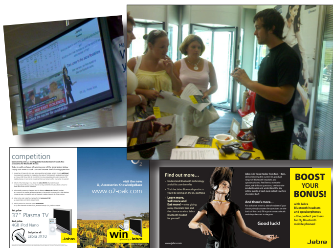
Call Centre Product Launch Road Show & Sponsorship 6 day event, top product download month after launch