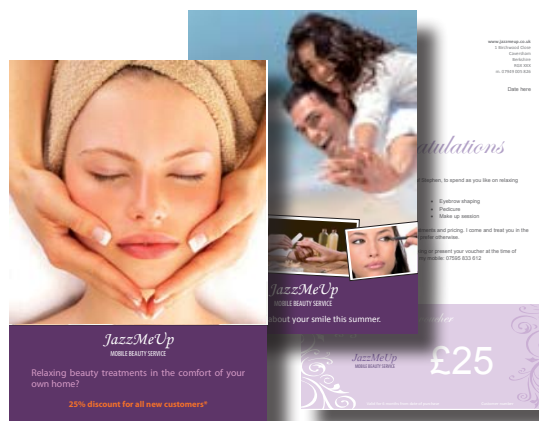
New Business Development Series of promotional flyers, increased customer base by 400% within first 3 months